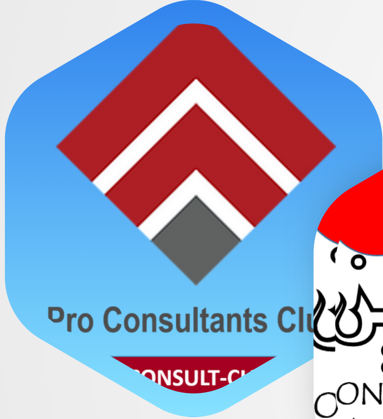
Pro Consultants Club