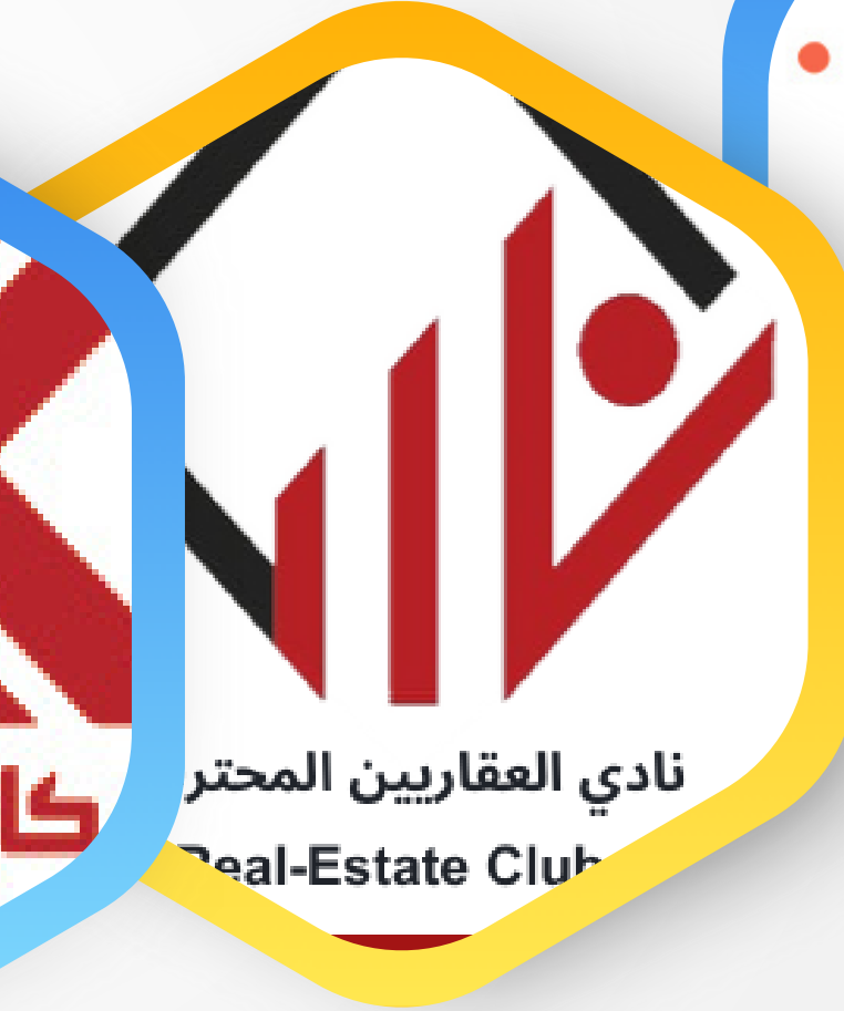
Pro Real-Estae Club