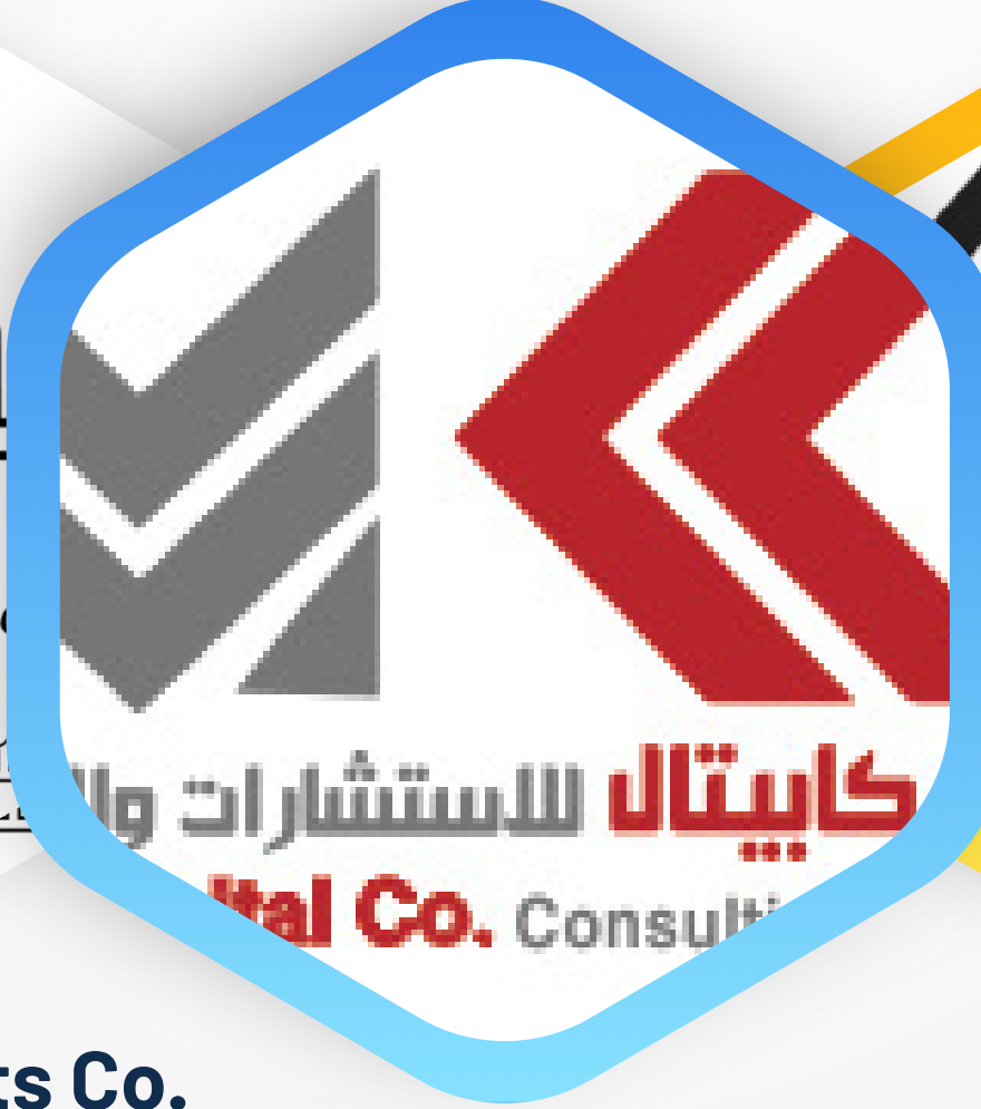
Mind Capital Consulting