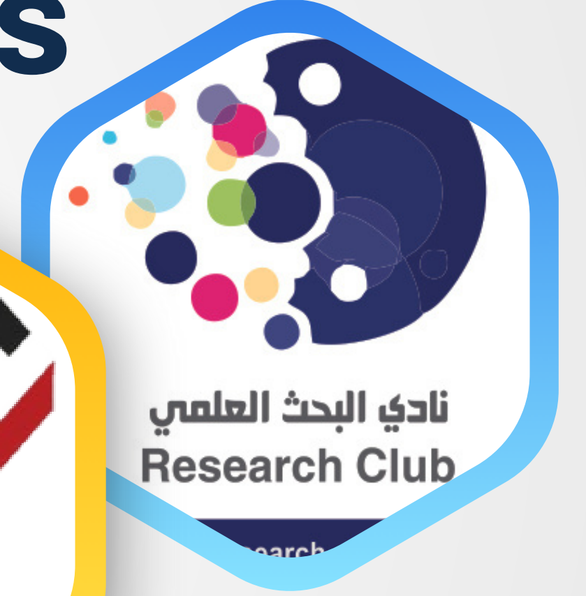
The Research Club