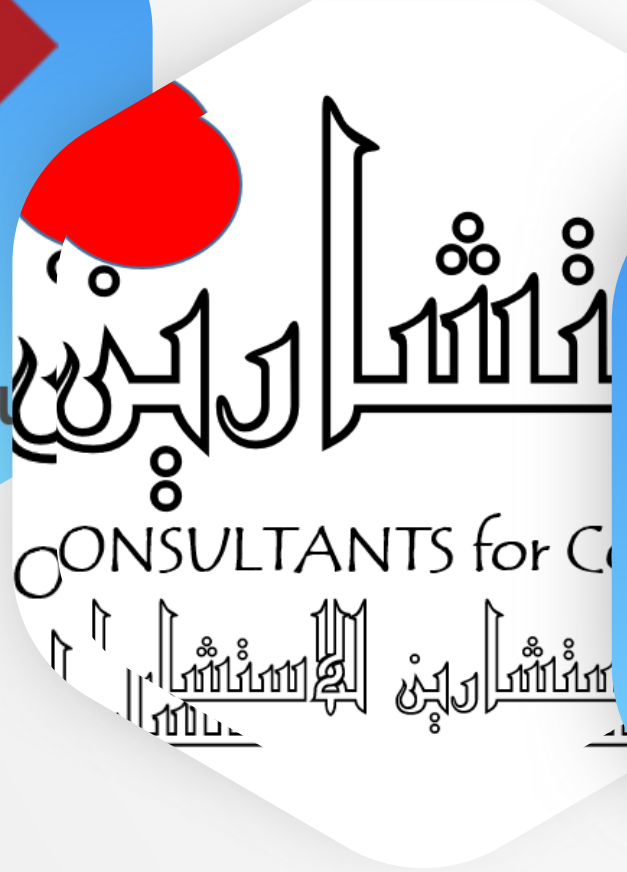
The Consultants Co.